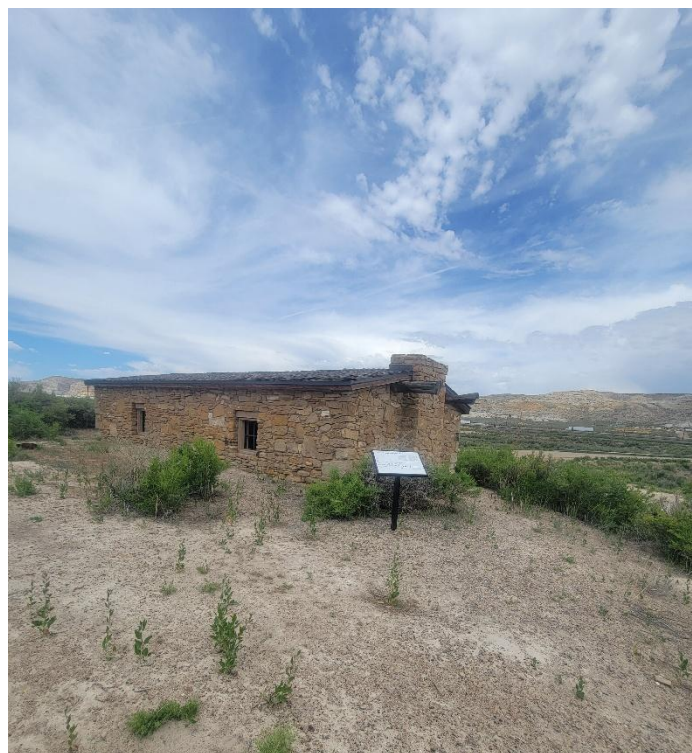
Point of Rocks Stage Station

It is fun exploring and seeing new sites along the way, all while playing radio.