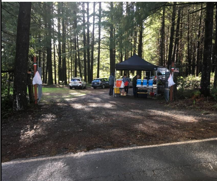
Aid Station 1 on Mountain House Road.

The Fish Rock Gravel Bike Ride was held on March 30, 2024. The ride started in Booneville and went to the coast at Point Arena on Mountain House Road and returned to Booneville on Fish Rock Road. The ride is just over 71 miles and is on paved and gravel roads in Mendocino County. It is really steep and beautiful country. The communications was done on the CARLA repeater system on the 70 CM band. The CARLA repeater system is amazing and covers a large portion of California. Check out the system at https://www.carlaradio.net/thesystem/ . I was stationed at Aid Station One, 15 miles out of Booneville on Mountain House Road.